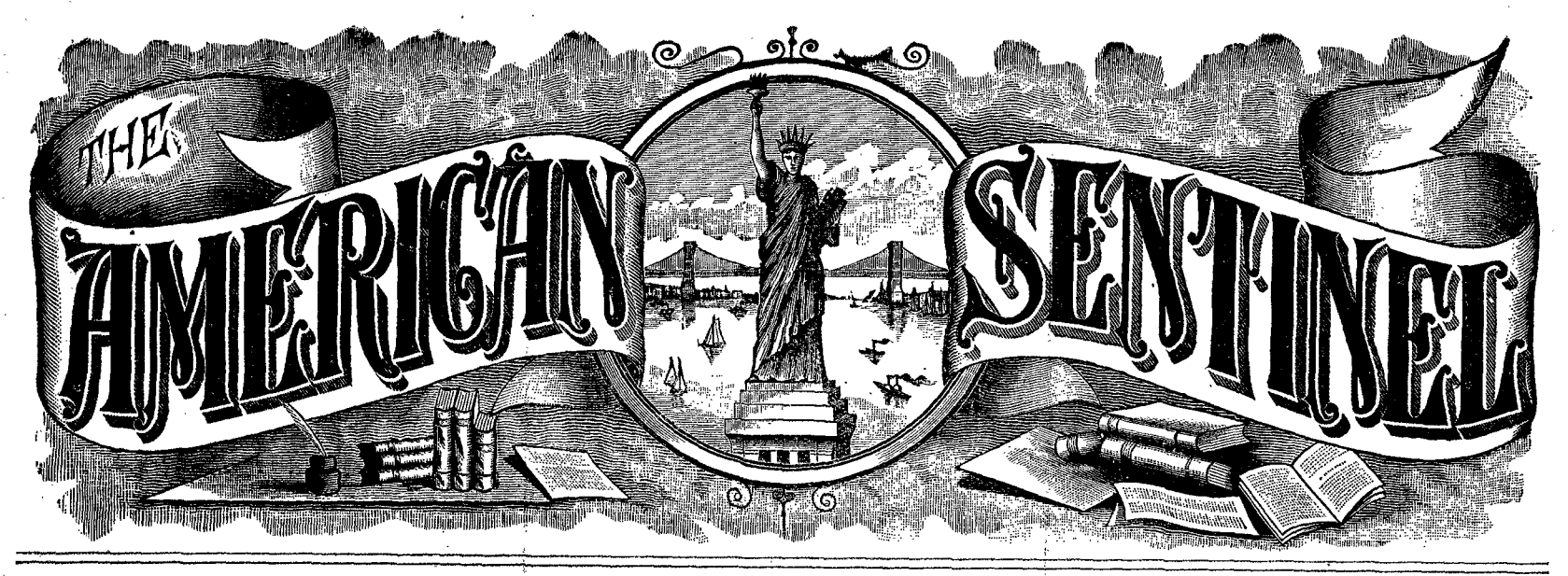
Equal and exact justice to all men, of whatever state or persuasion, religious or political. - Thomas Fefferson.