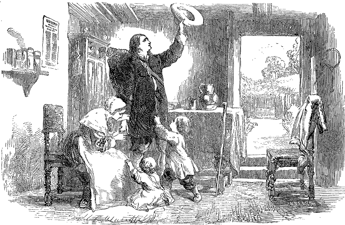
Roger Williams Leaving His Family For a Home in the Wilderness.

We appeal to all Baptists and all lovers of justice and right, Look upon the scene of Roger Williams bidding good-by to home and loved ones before fleeing into the wilderness from the hand of persecution! Look at that scene and remember that it has been repeated scores of times in the last few years in the States of Tennessee, Maryland, and Georgia! The eight imprisoned men at Dayton, Tenn., — imprisoned for their faithfulness to the same principle for which Roger Williams was banished — are men with human hearts, men who love their homes and families and are in turn loved by wife and children; and likely there were moistened eyes when the parting came, and the little ones clung to father's side. Oh, when will men cease to martyr the true heroes of their day while engaged in building the monuments of those martyred by their fathers! Thank God, there are men to-day who with a weeping