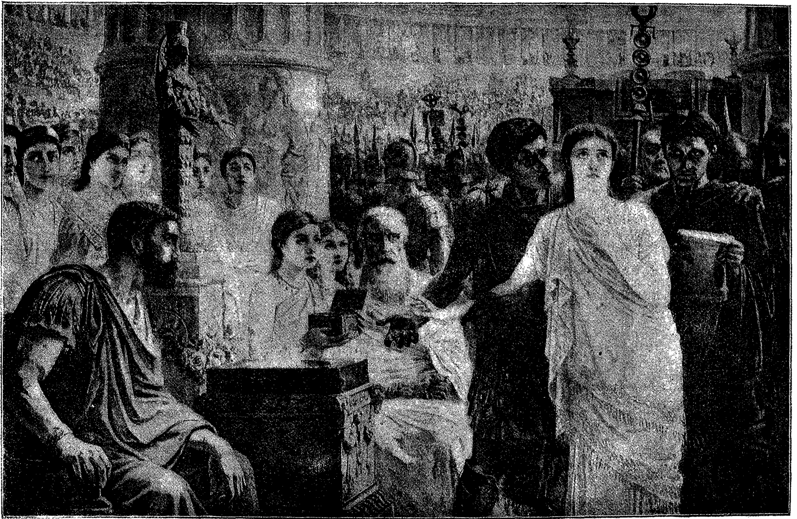
“CHRIST OR DIANA.”

“STEADFAST she looks to heaven, and breathes the Sacred Name, unmoved by lover’s plea, or sword, or rack, or flame. O holy hope in God! O fearless faith divine! undimmed by death, or time, or tears; immortal and sublime!