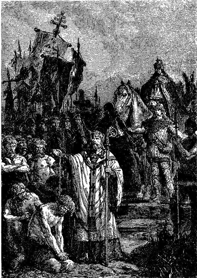
Charlemagne Inflicting "Baptism" upon the Saxons.

As we have before observed, there is no rest in compulsory idleness. Voluntary idleness is bad enough, but compulsory idleness is ten times worse. The promoters of compulsory Sunday observance will not be satisfied with a law which enjoins merely cessation from work and amusement, for they do not aim at the result which would follow from this alone. The evil of enforced idleness must finally result in a demand that the people be brought into the churches, where they may receive the benefit of religious services. It will be found that to enforce idleness is not to guard morality, but to promote immorality; and a religious observance of the Sunday will be viewed as a logical necessity of the situation.