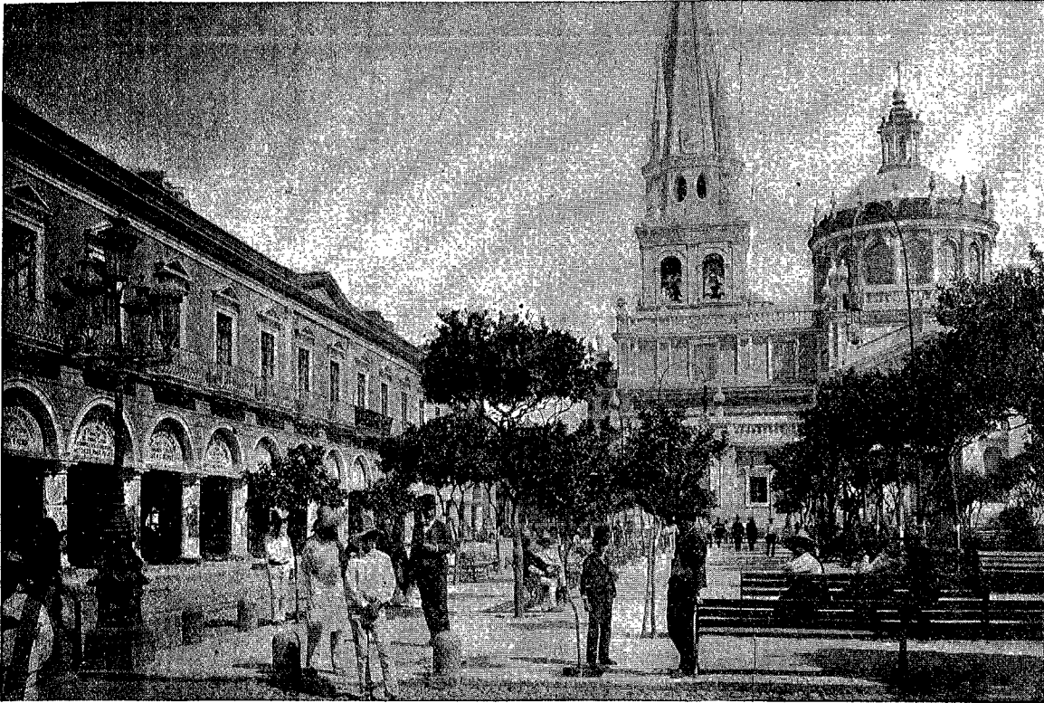
PLAZA DE ARMAS AND CATHEDRAL, GUADALAJARA.

ART. V. No religious act shall be performed publicly in any other place than the interior of the churches, under penalty of the rite being suspended and the authors punished by a fine of not less than $10 nor more than $200, or imprisonment for not less than two nor more than fifteen days. When, however, the act may assume a grave character by the number of persons that may engage in it or from whatever other cause, the author of it, as well as such other persons as may not obey the intimation of the authorities that the act should be suspended, shall be