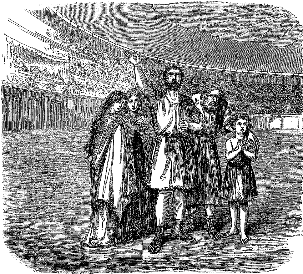
CHRISTIAN MARTYRS IN THE CIRCUS AT ALEXANDRIA.

It will be seen at once that for any man to profess the principles and the name of Christ, was virtually to set himself against the Roman Empire; for him to recognize God as revealed in Jesus Christ as the highest good, was looked upon by Rome as nothing else than high treason; because as the Roman State represented to the Roman the highest idea of good, for any man to assert that there was a higher good, was to make Rome itself subordinate. And this would not be regarded in any other light by Roman pride than as a direct blow at the dignity of