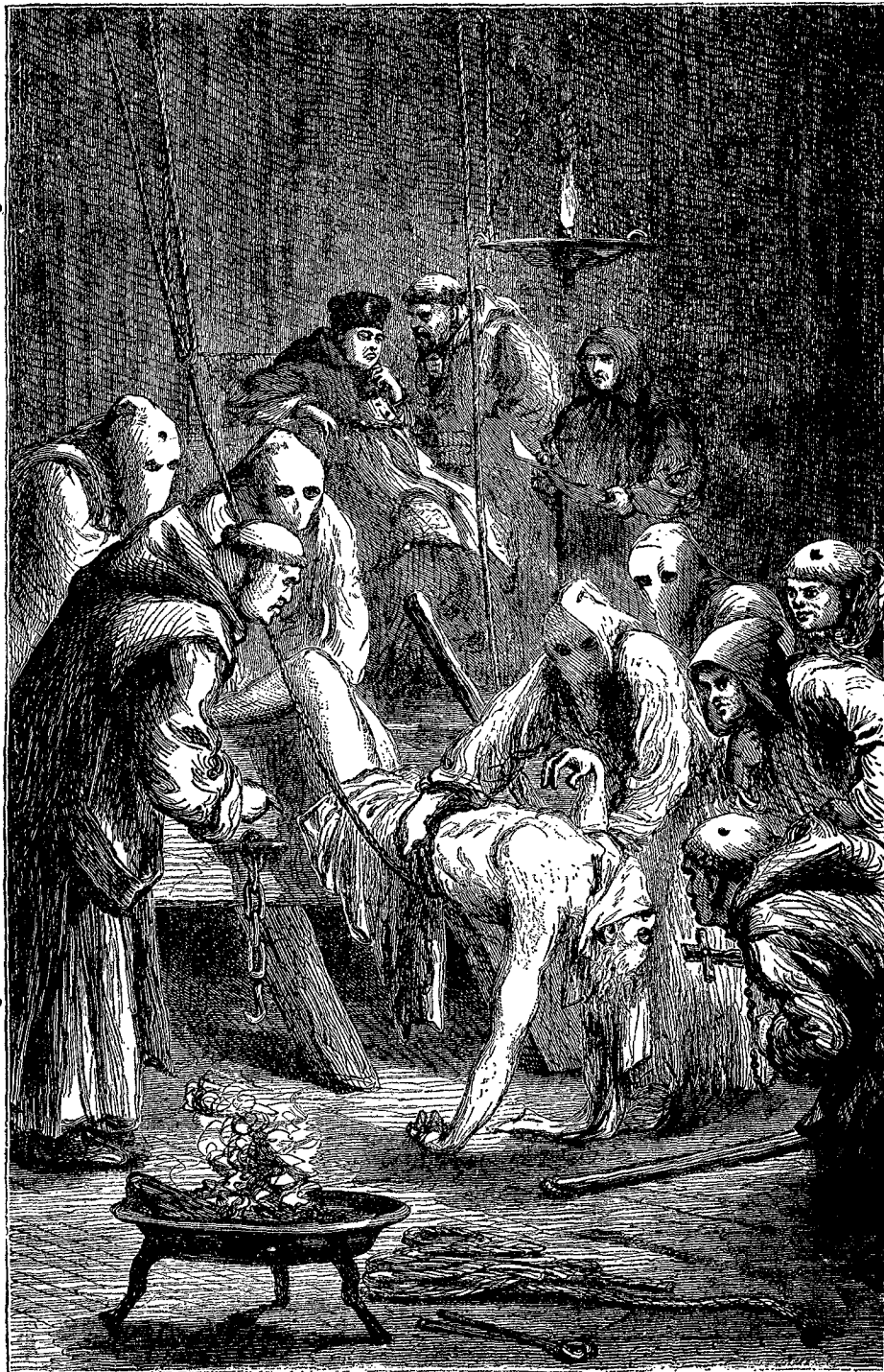
TORTURE CHAMBER OF THE INQUISITION.

yet we are assured in the closing decade of the nineteenth century that the tribunal which habitually inflicted this fiendish torture was almost compassionate!