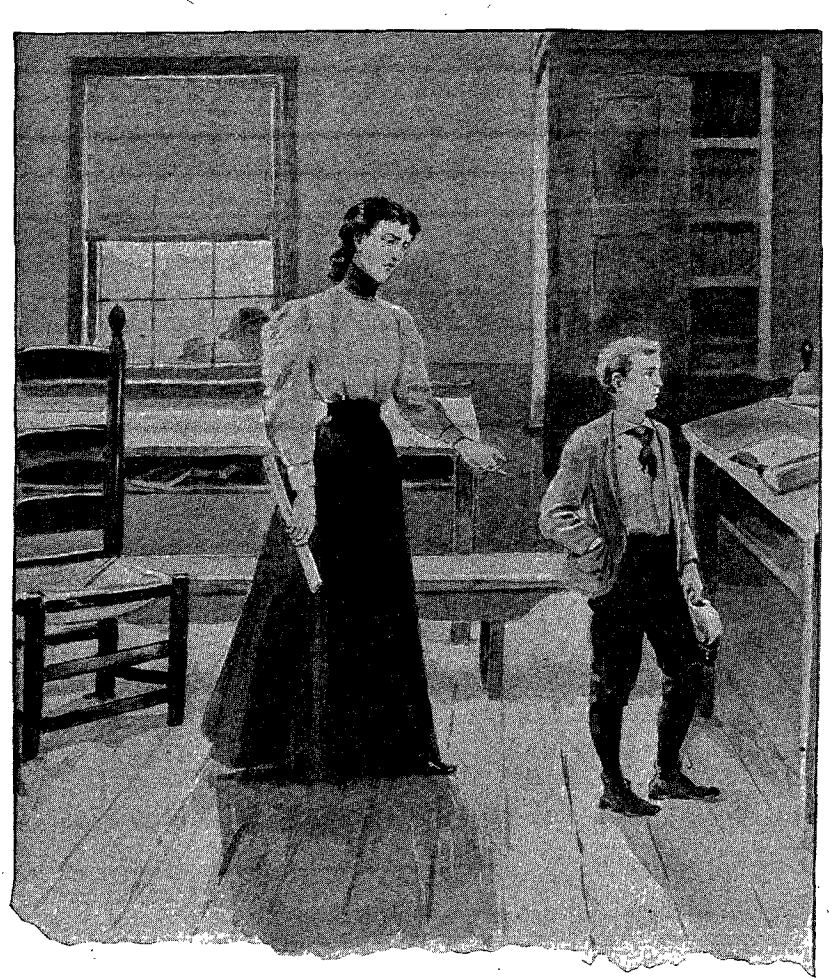
The teacher kept the boy after school and compelled him to sing the verse printed underneath the picture, on the left, which he had been instructed not to sing by his parents, who do not believe in Sunday laws.

It may be said that Sunday laws have been enacted all along from the time when church and state were united down to the present; and this is true. But it is not to the point. It would be more correct to say that they have been re-enacted. In substance, they have simply been handed down from century to century, till they have come down to us. The spirit which enters into them,—the "patriotism" which