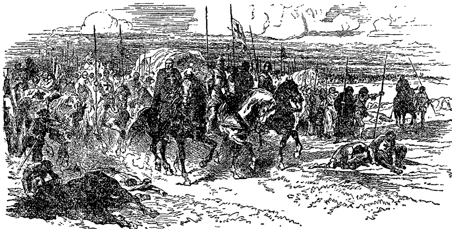
CRUSADERS ON THEIR WAY TO PALESTINE.

"Thirty-five years, and was succeeded by Henry the First, his son, and Philip the First, his grandson. Henry reigned twenty-nine years, but his reign seemed to be quite uneventful. Philip had a long reign of forty-eight years. The historian does not give Philip I. a very good name, I am sorry to say; but kind and just rulers are always the exception, not the rule.