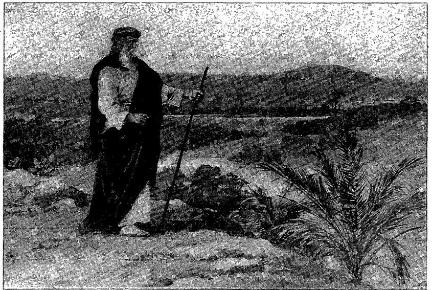
Abraham walking through the promised land.

This is the kingdom of God's grace. As the gospel of the kingdom is preached in Satan's territory, men may, by refusing to acknowledge Satan's reign, be counted as