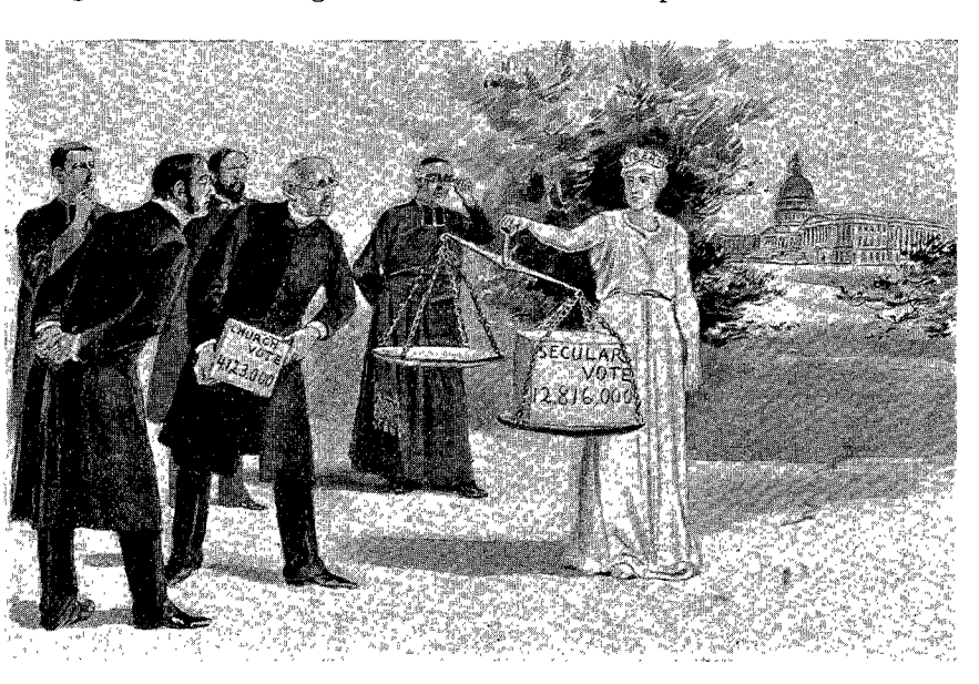
WILL THE CHURCH VOTE OUTWEIGH THE SECULAR VOTE?

THE cause of righteousness was never promoted in the earth by a compromise with evil.